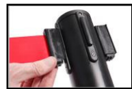
Belt lock to prevent Accidental belt release