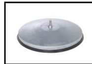
Concrete filled Galvanized steel base