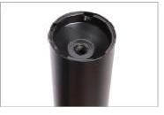
.055 Gauge Steel/stainless steel