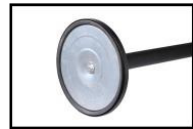
Full circumference Floor protector