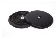
Low profile Cast iron base