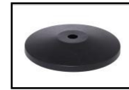
Replaceable anti scuff Base cover