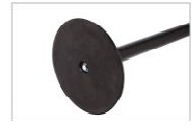
Full coverage rubber Floor protector