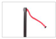
Break for slow, safe Belt retraction