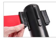
Belt lock to prevent accidental belt release