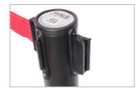
Universal belt end connects to all major brands