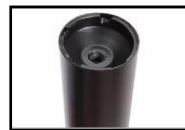
.039 Gauge Steel/stainless steel